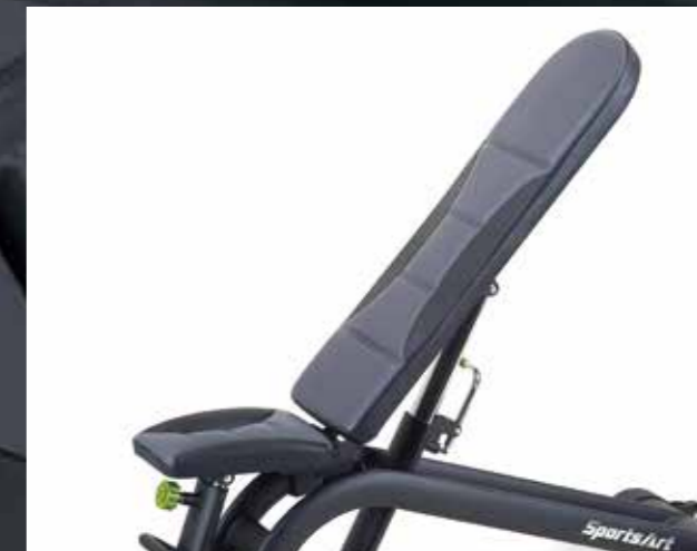
Contoured and molded seat pads provide comfort and ergonomic support for a variety of movements. Marine grade upholstery is tear resistant and available in a variety of color combinations to compliment any gym decor.