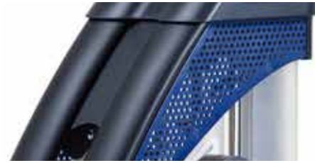
BLUE PANTONE 287C

*Speak to your sales representative for cost and lead time information.