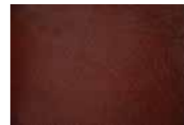
Burnt Orange #15