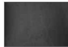
Smokey Gray #2 (standard)