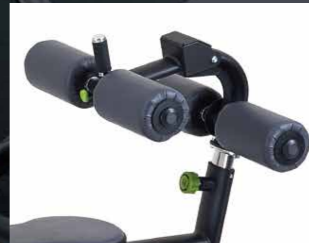
Multiple adjustment points for user convenience and comfort.