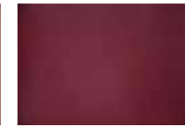
Maroon Red #5