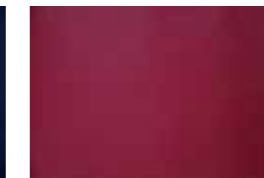
Plum Red #43