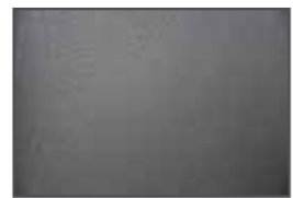
Sterling Gray #1