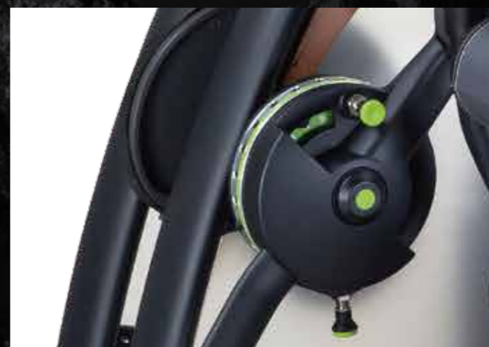
Specially designed cams follow an appropriate strength curve to match load and joint position—providing a more efficient workout.