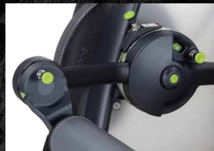
Range limiting devices allow for the perfect unit setup—ideal for rehabilitation or sport-specific training.