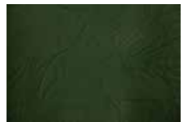
Forest Green #14