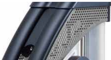
SILVER PANTONE 877C