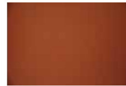
Flame Orange #4