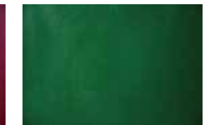
Shamrock Green #45