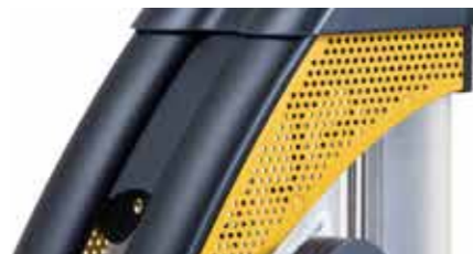
YELLOW PANTONE 123C