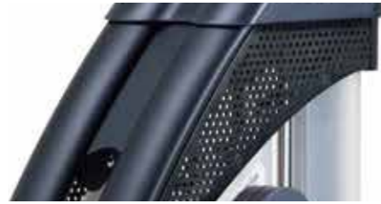
CHARCOAL PANTONE 433C