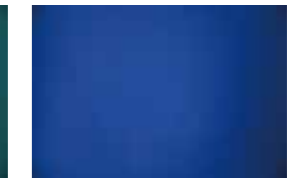
Sea Blue #7