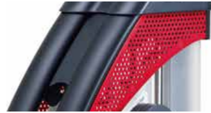
RED PANTONE 185C