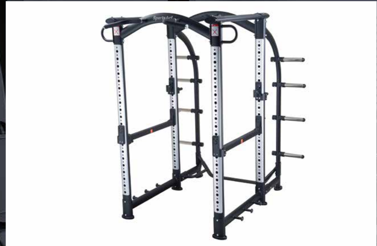
Durable, welded steel frame units that provide exercisers with a stable, comfortable, and safe workout environment. Allowing users to focus on effective workouts that meet their needs.