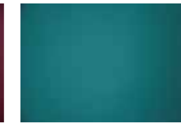
Aqua Green #6