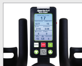
LCD Digital Display