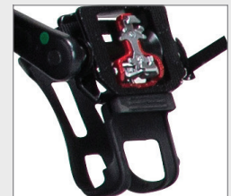
Dual-Clip Foot Pedal