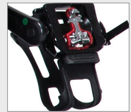
Dual-Clip Foot Pedal