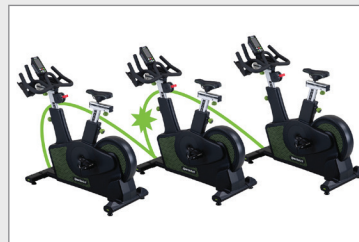
Connect Multiple Units